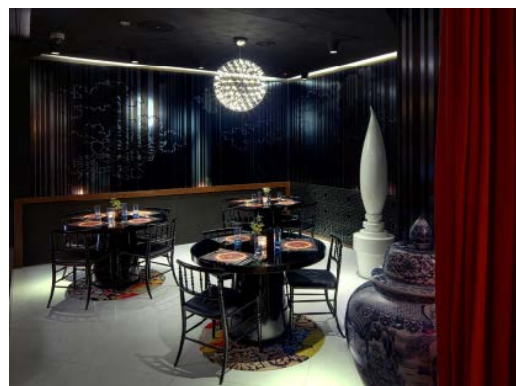
Supergiant Tapas & Cocktail Bar

Download high-resolution images at: https://we.tl/Ay7Y2NFY5n