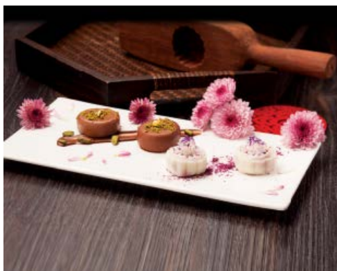
Chocolate Bonbon with Egg Custard and Snow Skin Taro Mooncakes with Bird Nest